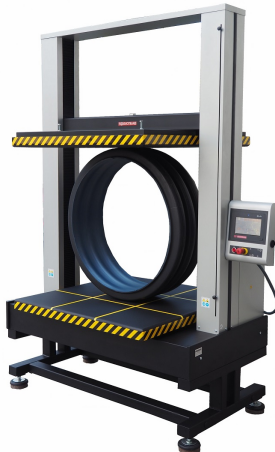
DVT GP D S100 N - RING STIFFNESS TESTER FOR PIPES