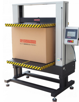
DVT GP D S80 N BOX CRUSH TESTER